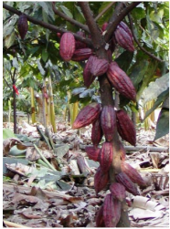
Something special about your cocoa?

Would you choose a Swiss watch over another brand? Champagne instead of wine? Jamaica's Blue Mountain over another coffee brand?